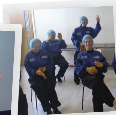
Then it was the safety briefing