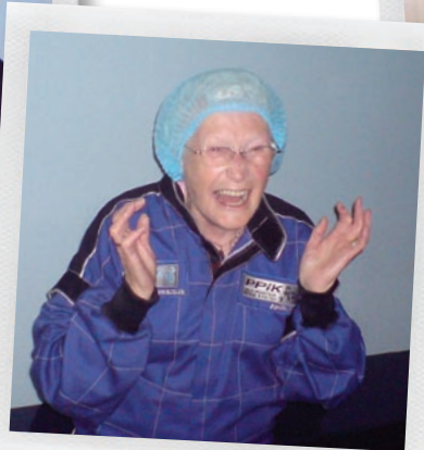
First, they had to get into the right gear