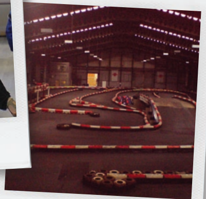
Round this track at speeds up to 45 mph in tiny karts!