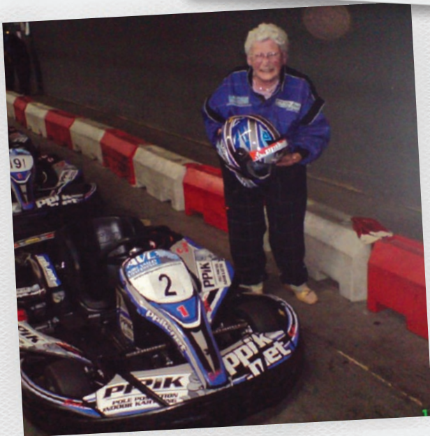
Nothing to it!